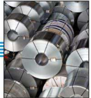
Stainless Steel User