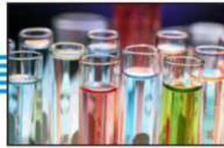
Chemicals Machinery Plant