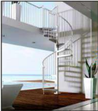
House Hold Articles