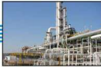
Oil Refinery Pipelines Plants