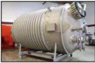
Heat Exchanger & Pressure Vessels.