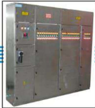
Electricals Panel Bord Plant