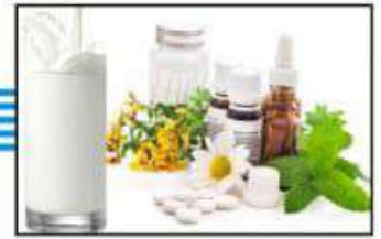
Pharma, Dairy & Food Process Plant